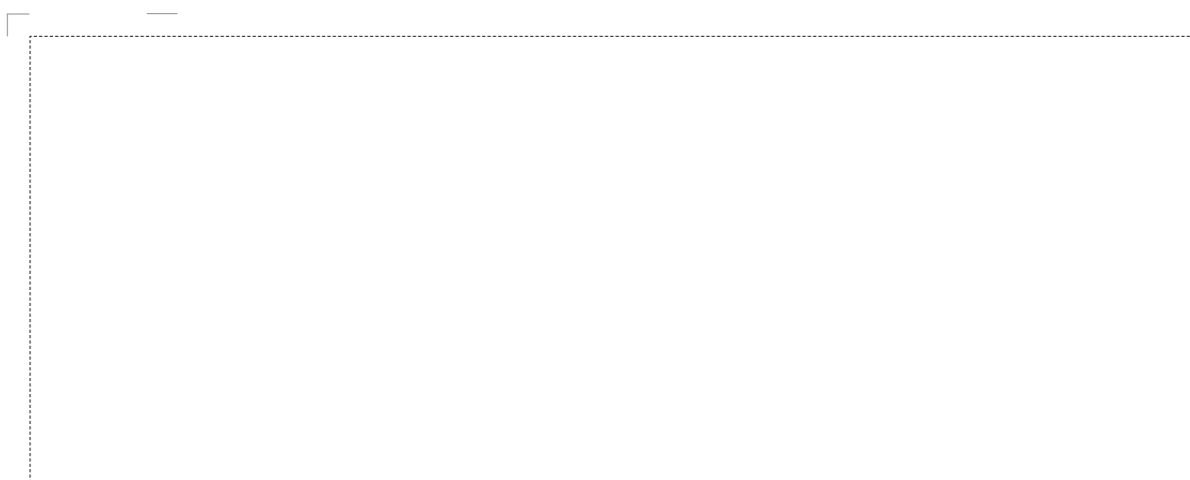
Polished Marble W180/111 W181/111